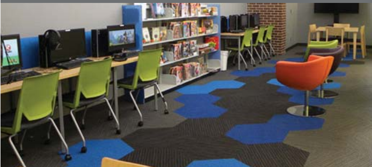
Dedicated Teen Space