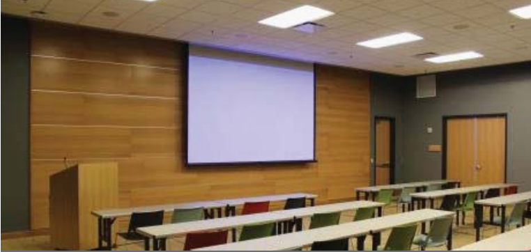
More Meeting & Program Space