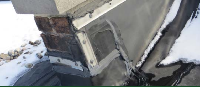
The library's existing roof is at end of its expected life and has already undergone several repairs and patch jobs.

The Villa Park Public Library building is over 45 years old. Although structurally sound, the building has a number of issues requiring urgent attention.