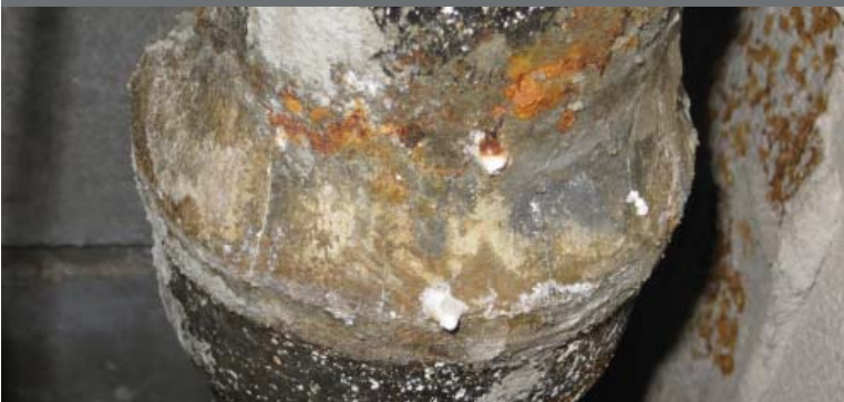
Plumbing issues exist throughout the building due to limited water supply and sanitary sewer capacity to the building.