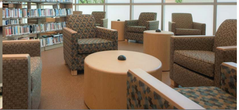
More Comfortable Seating With Power Outlets