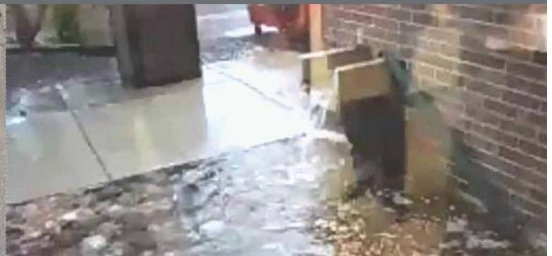
The Library's roof drains onto sidewalks and paved areas at the east and west sides of the building and freeze during cold weather.