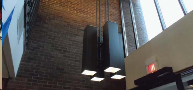
Many of the library's light fixtures and exterior windows are original to the building and inefficient.