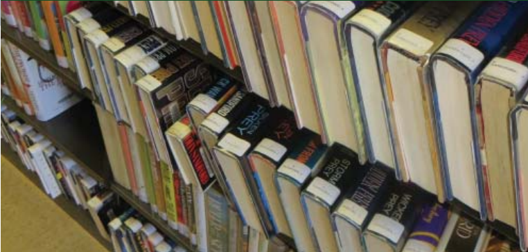
Shelving is at capacity, with aisles between shelving narrower than the minimum required by current codes.