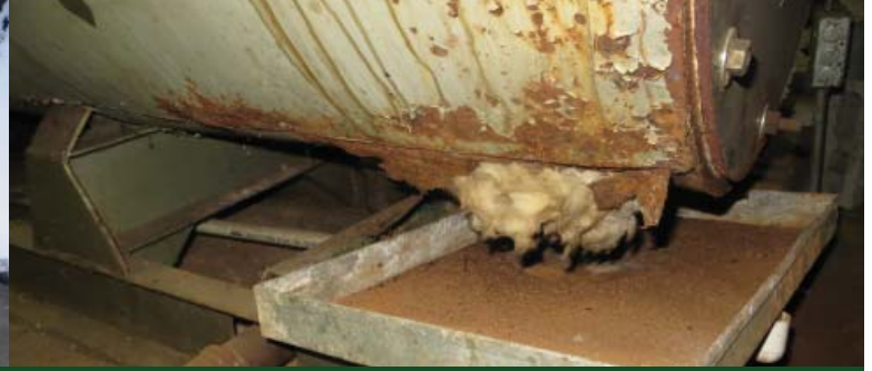
The Library's existing boilers and air handlers are original to the facility, inefficient, and expensive to maintain and operate.