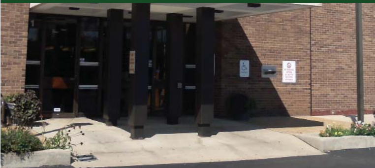
The entrance to the library requires walking up a steep slope which becomes slippery in freezing and wet weather.