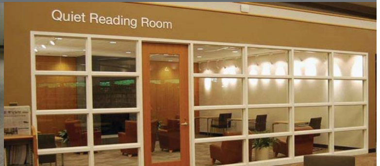
Quiet Reading Room

The Villa Park Public Library is planning for the future... and seeking YOUR feedback and comments regarding what you would like to see in a renovated and expanded Library building.