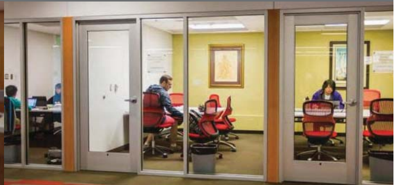
More Study Rooms